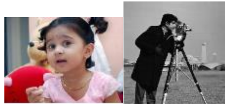
Fig 2 : Standard Output Of Resolution Enhancement

In[3], adaptive BSR algorithm used in which the cost function is based on Alternating Minimization approach, the regularization for image and blur are Huber Markov Random field Model and Gaussian. The estimated PSNR value is 29 dB.